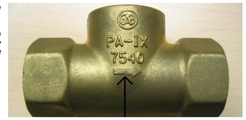
Photo 2 – shows the cartridge cavity for incoming and outgoing waterways.

This shows how water <u>MUST</u> be plumbed to valve body inlet and outlet ports. If this water flow direction is <u>NOT</u> followed the valve <u>MUST</u> be reinstalled.