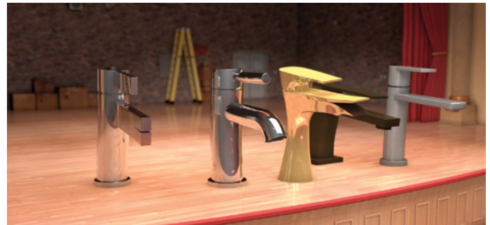
California Faucets single-hole quintet takes the stage

throughout the residential and commercial design and construction industries.