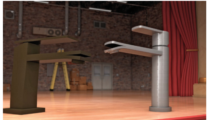
Morro Bay and Arpeggio duet

The annual MarCom Awards recognizes the most innovative and effective marketing campaigns